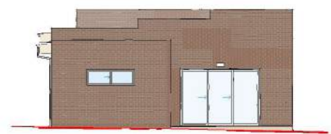
Side elevation 2