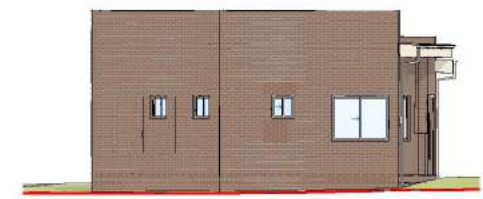
Side elevation 1